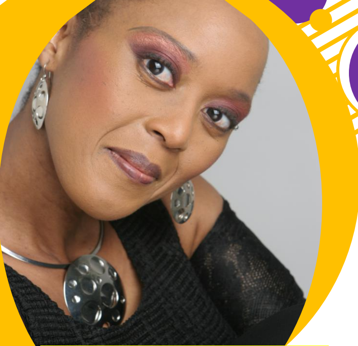
Tsidii Le Loka South African Choral Traditions